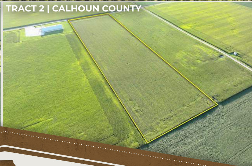
TRACT 2 | CALHOUN COUNTY