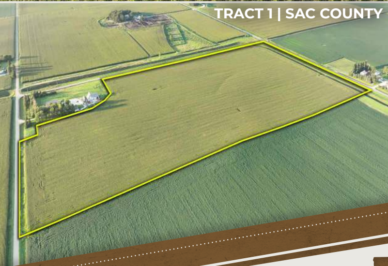
TRACT 1 | SAC COUNTY